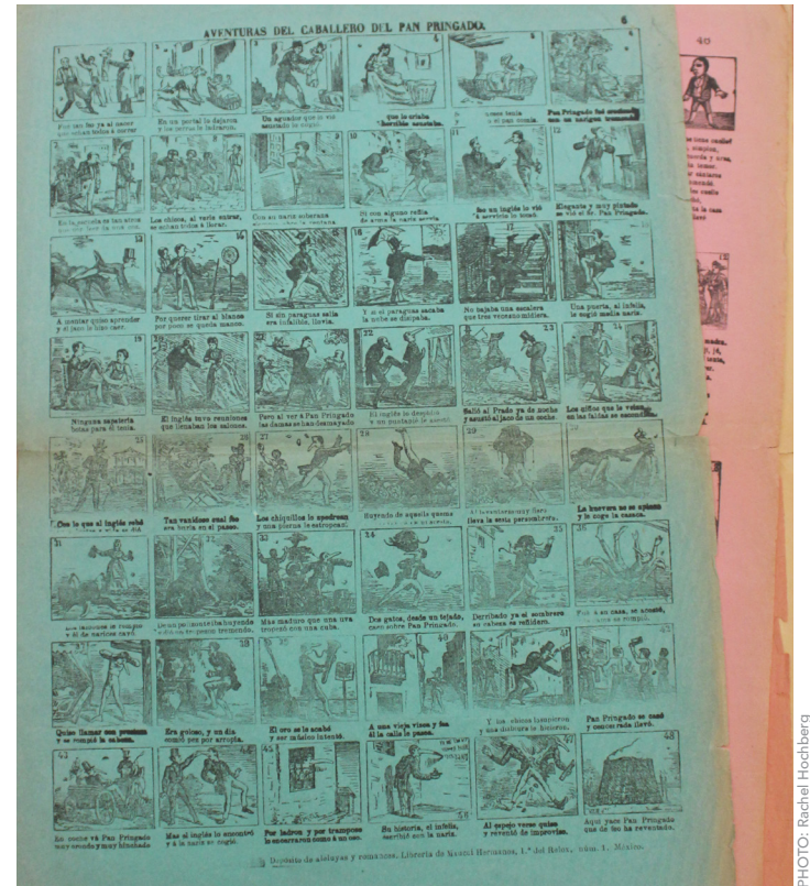
A new acquisition in QSC: broadside cartoons from Mexico by Maucci Hermanos, ca. 1900.

Mouret, R.Z. '20, Jain, Roshan (Biology), et al. (2024). "The adaptor protein 2 (AP2) complex modulates habit-