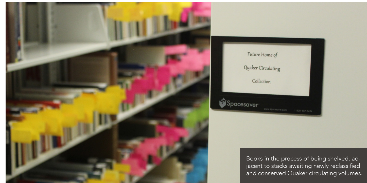
Books in the process of being shelved, adjacent to stacks awaiting newly reclassified and conserved Quaker circulating volumes.

WATCH THIS AND OTHER TWO-MINUTE THESIS VIDEOS AT https://vimeo.com/showcase/3263477