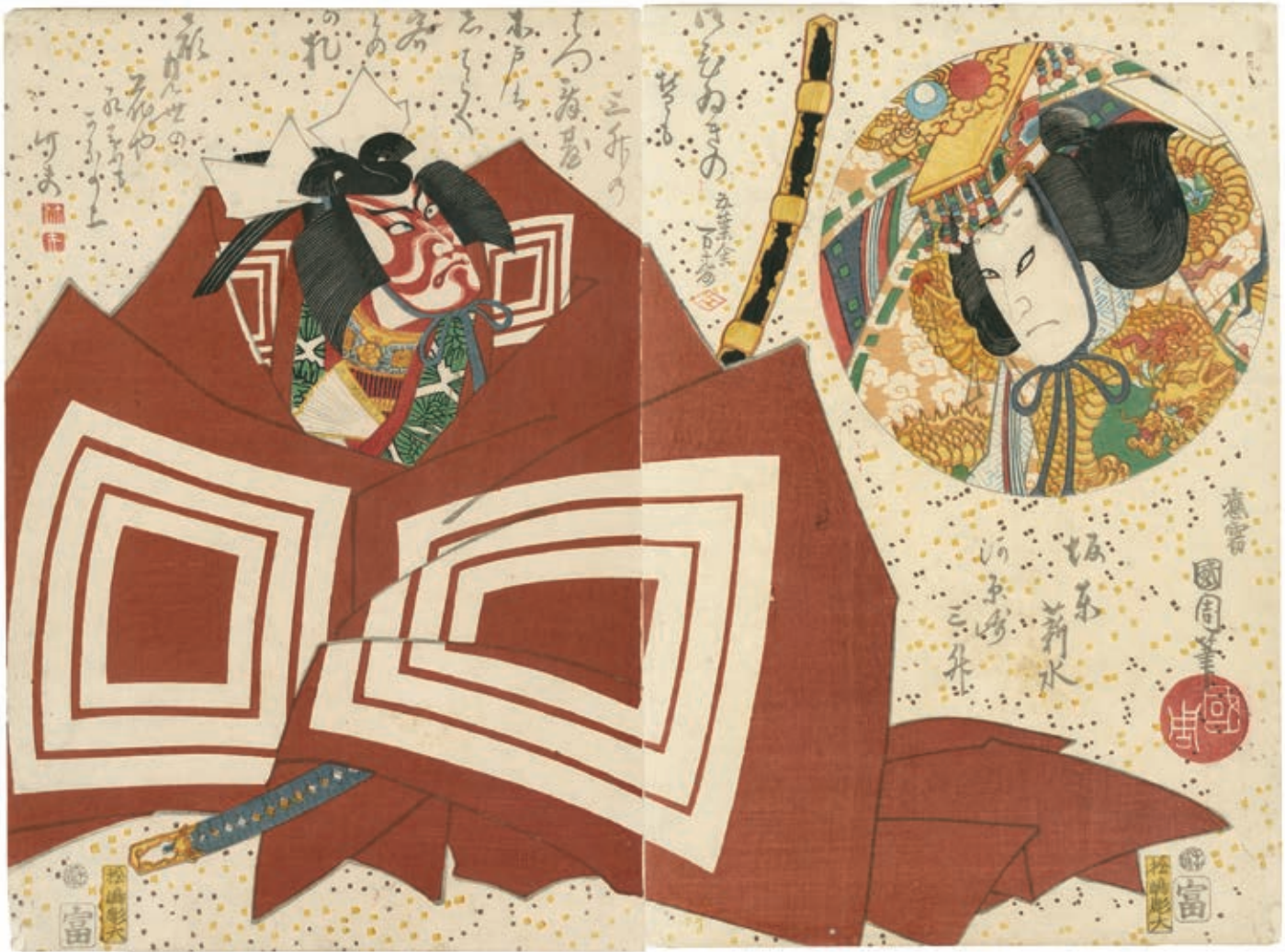
Fig. 2: Toyohara Kunichika (豊原 国周). Danjuro IX in Shibaraku . 1869. Arnold Satterthwait, Class of 1966, Collection.

pre-Tokugawa past into provocative tension with the floating world present. The legacy of the ukiyo-e has lived on, not only in the works of contemporary print artists, but also in the exhibition space. Ultimately, the experience of beholding a woodblock print is the same for the contemporary gallery viewer as it was for the Edoite: to lay one's eyes on a print is to be transported temporally and spatially into an alternate universe, the combination of beauty, drama, and fantasy that is the floating world.