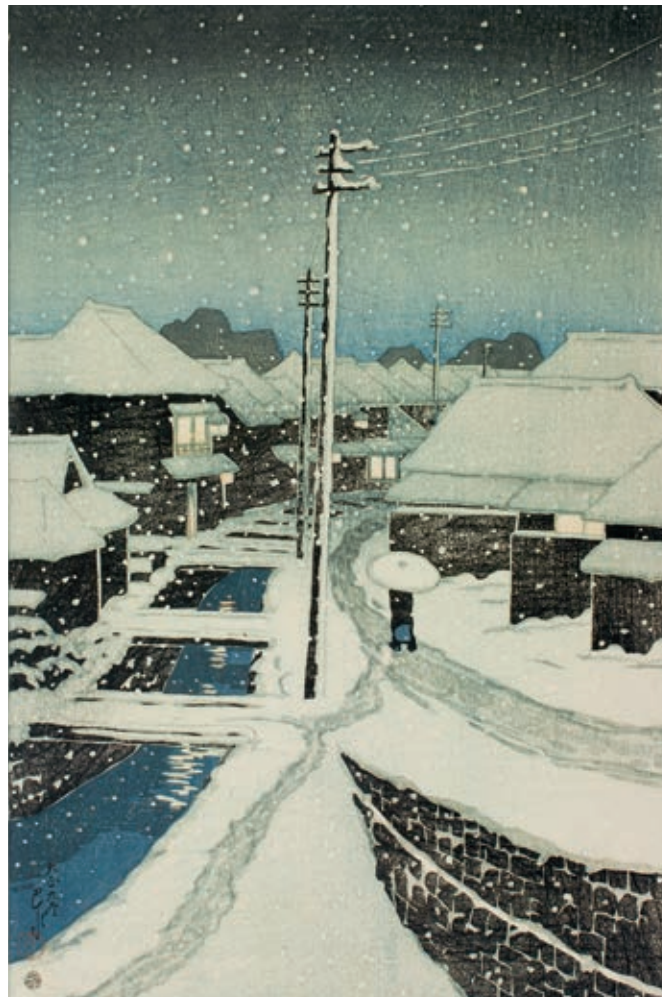
Fig. 11: Kawase Hasui (川瀬巴水). Evening Snow at Terashima Village ( Yuki ni kure no Terashima mura ), from the series Twelve Scenes of Tokyo ( Tōkyō Jūnidai ). 1920. Bryn Mawr Special Collections.

The continued influence of ukiyo-e is not restricted to imagery; it also appears in the collection of ukiyo-e by both individuals and institutions in Japan and the West. It is through these collections, like the Arnold Satterthwait, Class of 1966, Collection featured in this exhibit, that the floating world lives on.