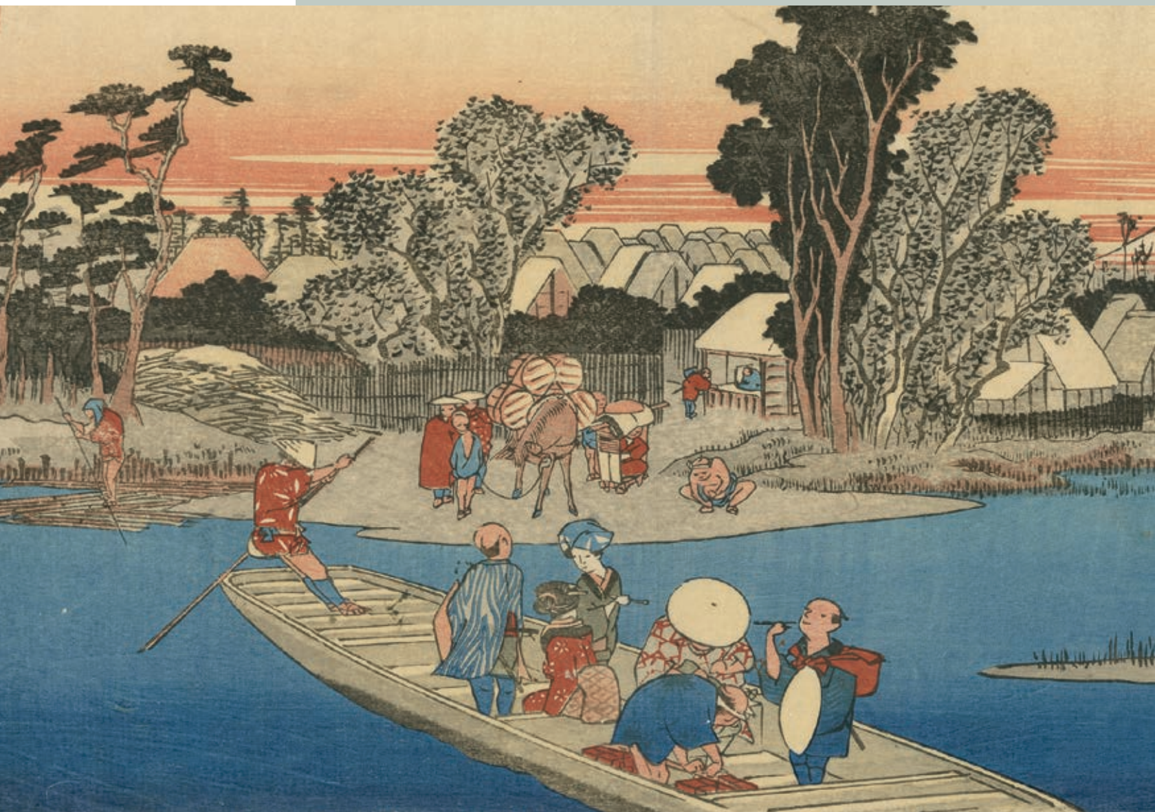
Detail of Fig. 5.