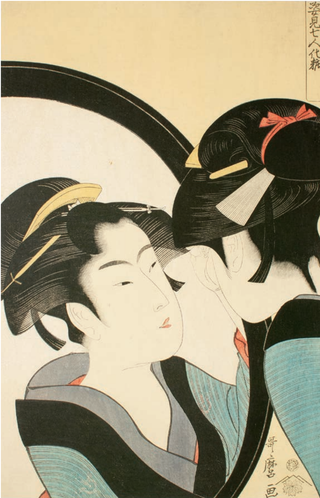
Fig. 7: Kitagawa Utamaro (喜多川歌麿). Picture of a Woman Applying Makeup (Bijin Keshō no Zu) , from the series Seven Women Applying Makeup Using a Mirror (Sugatami Shichinin Keshō) . ca. 1789.