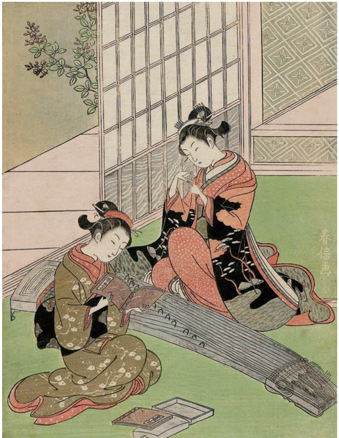
Fig. 9: Suzuki Harunobu (鈴木春信). Descending Geese of the Koto Bridges (Kotoji no rakugan) from the series Eight Views of the Parlor (Zashiki hakkei) . 1766. Museum of Fine Arts, Boston.