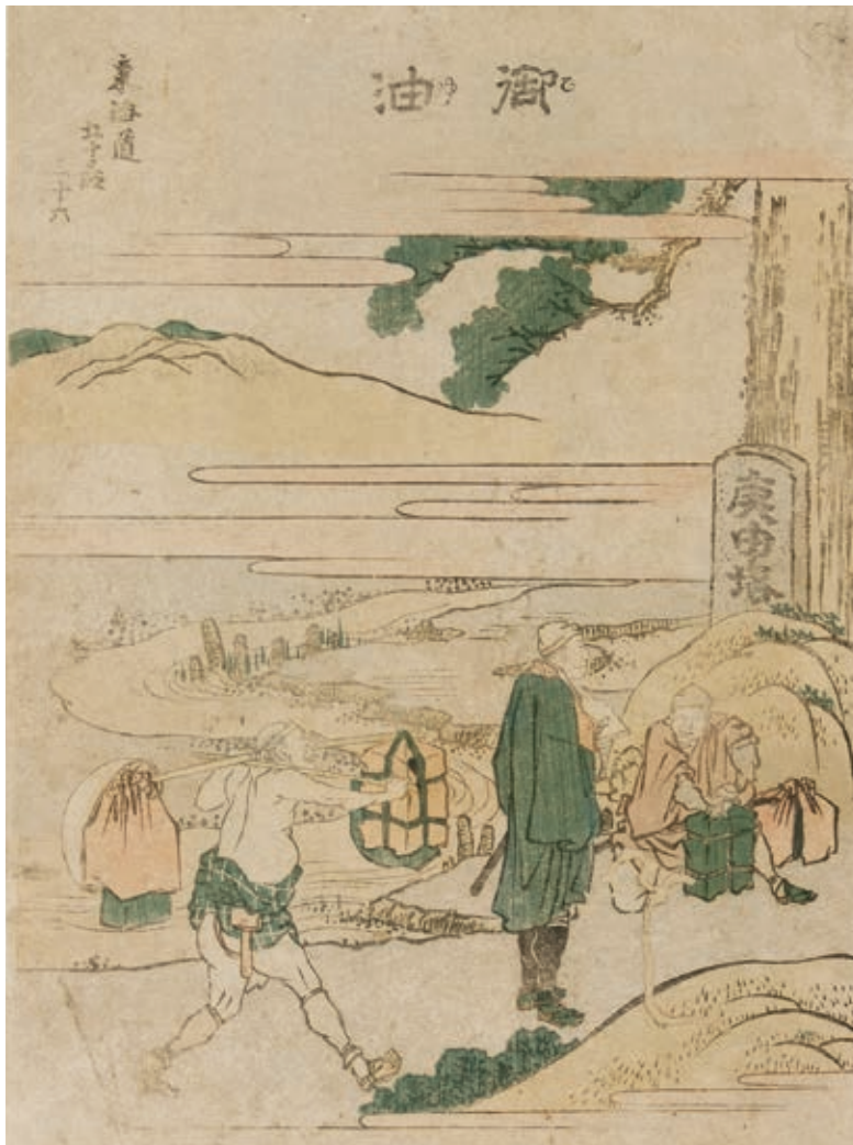
Fig. 4: Katsushika Hokusai (葛飾北斎). Goyu , from the series Fifty-Three Stations of the Tōkaidō ( Tōkaidō gojusan tsugi ). 1805–1806. Bryn Mawr Special Collections.

One of the earliest known appearances of the Tōkaidō theme in woodblock prints was an untitled set (c. 1801) by Katsushika Hokusai (葛飾北斎) (1760–1849). Although the artist likely capitalized on the popularity of meisho zue and meisho-ki , he took a novel approach that set his compositions apart from those of his predecessors. For the most part, meisho zue illustrations depict bustling town-centers, bridges, and landscapes from an aerial perspective. The focus is on the scene as a whole, rather than on any singular subject. Hokusai's compositions, by contrast, bring the point of view closer to the spectator, and are more concerned with capturing mundane moments such as the daily lives of the stations' inhabitants and interactions between locals and tourists. In the process, they often downplay the opportunities for portraying the magnificent scenic points of the Tōkaidō. 23 The print Goyu (御油) (1805–1806), for example, is situated