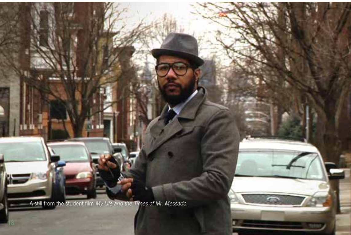
A still from the student film My Life and the Times of Mr. Messado .