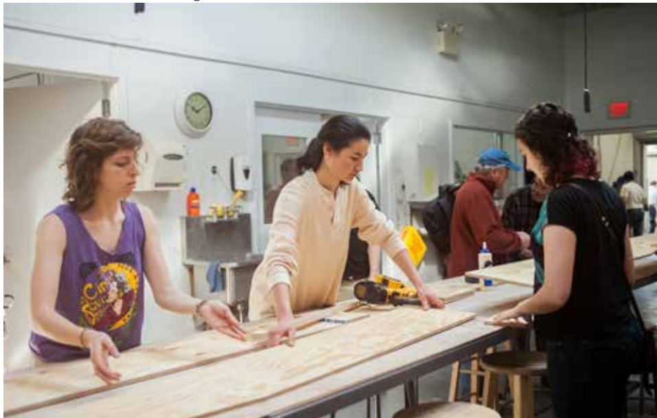
Students work on the Critical Making Seminar's DIY boat with Mare Liberum.