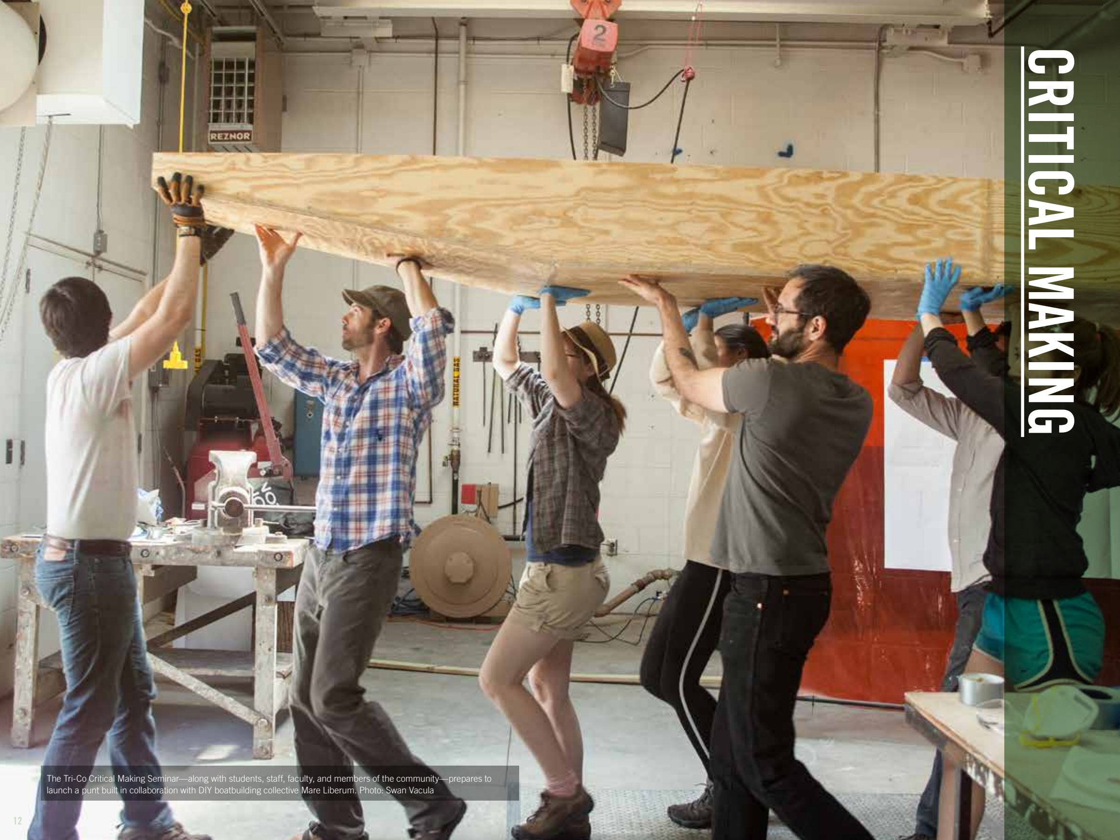
The Tri-Co Critical Making Seminar—along with students, staff, faculty, and members of the community—prepares to launch a punt built in collaboration with DIY boatbuilding collective Mare Liberum.