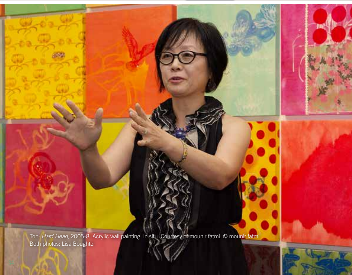
Top: Hard Head , 2005-8. Acrylic wall painting, in situ. Courtesy of mounir fatmi. © mounir fatmi. Both photos: Lisa Boughter