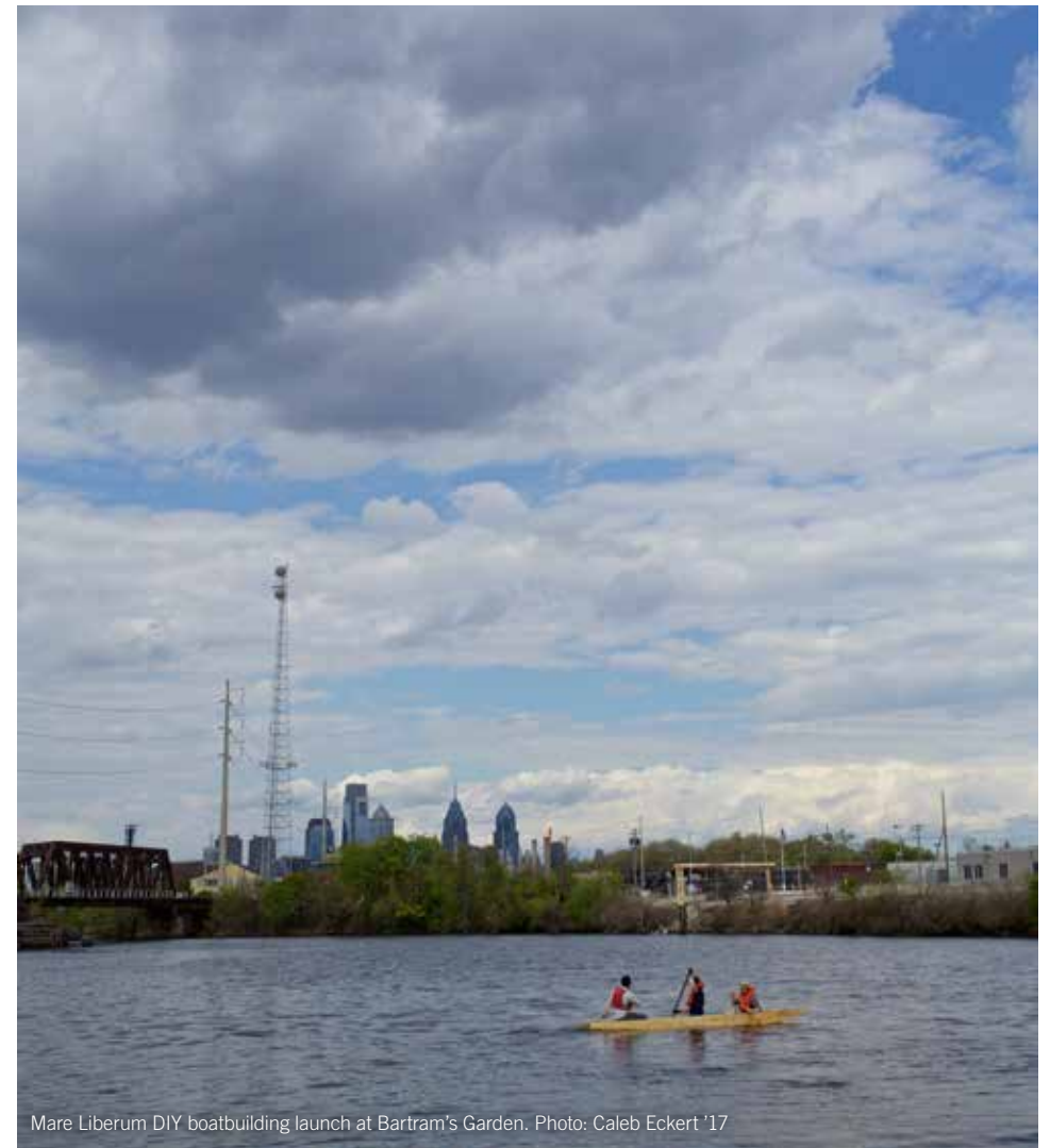
Mare Liberum DIY boatbuilding launch at Bartram's Garden.