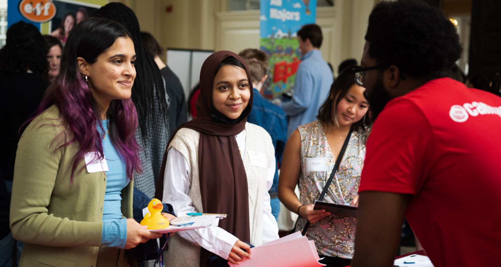
Students in Founders Hall talking to a Campus Philly representative.