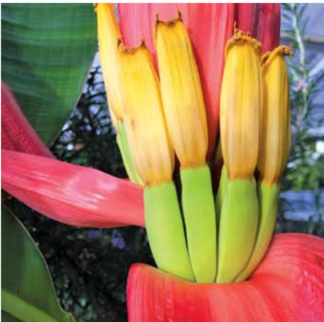
Tropical plants, including this small banana tree, Musa sp., bloom happily in the greenhouse over the winter months.