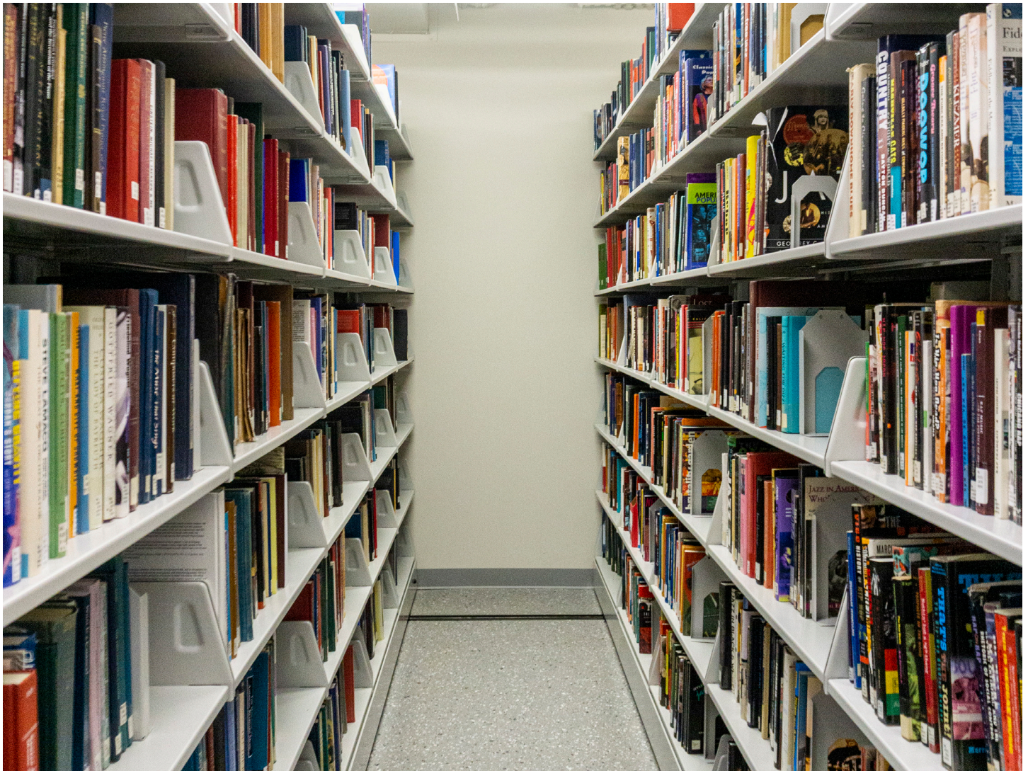
The stacks in the Nan & Bill Harris Music Library.