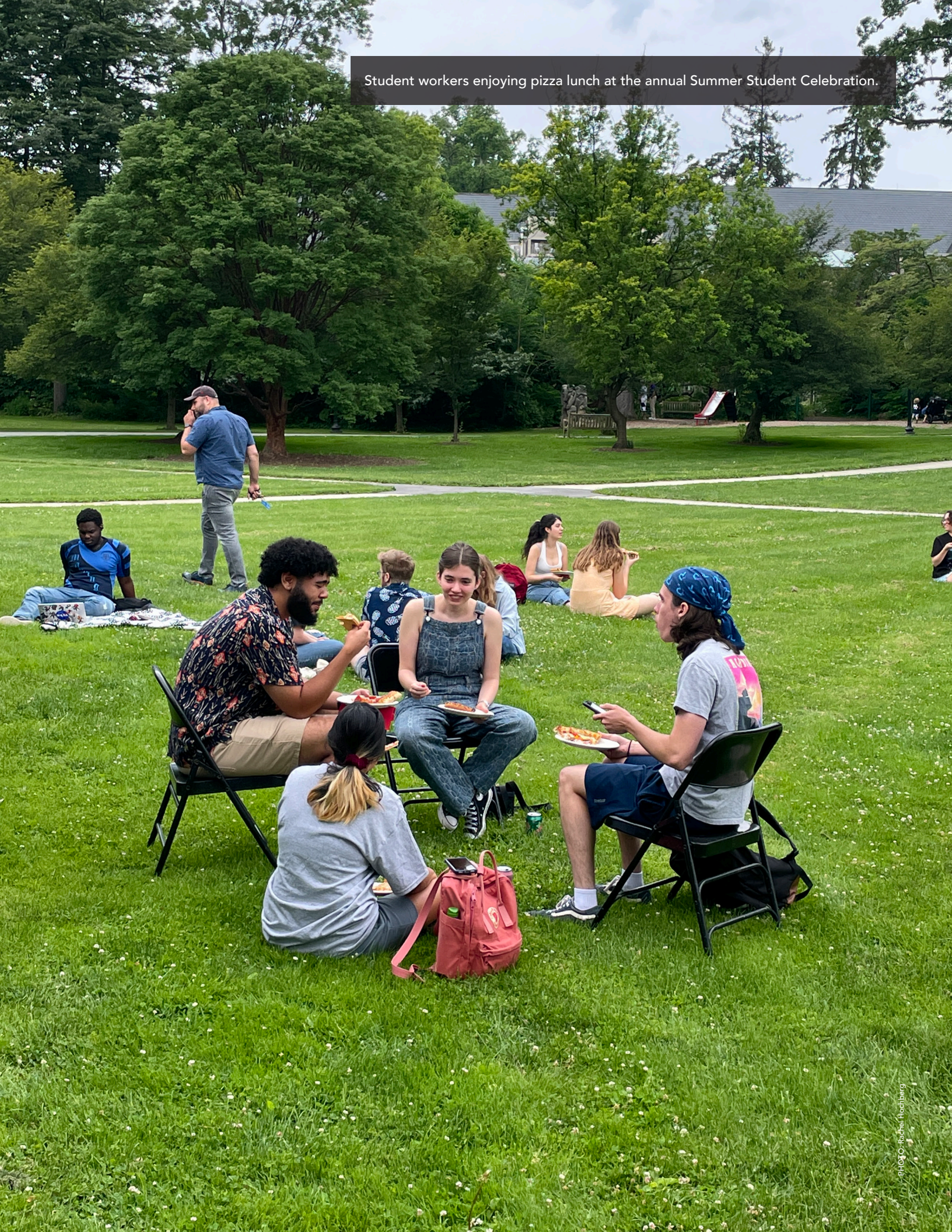
Student workers enjoying pizza lunch at the annual Summer Student Celebration.